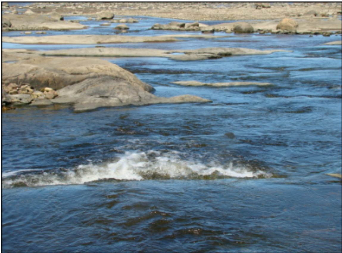
Fresh water at Ranger Bight.

Taimali SuliaKapvinga Avatiliginimmut amma AsikKitailinimmut (DOEC) taijaujullu Water Resources Portal Kagitaujatigut katitsutausimajut kamagillugit Kaujimajutsaugivugut imittavet avatinginnetut ammalu imittavimmetut pujuit ottutausimajut Kaujitsiutet Maggovimmi imiup tauttungata ottotinga 2005-imit 2011-imut atjigegalainnaKuk allât piunitsaudluni malittauKujaujumit prâvinsiup maligatsangitigut (Government of Newfoundland and Labrador DOEC, 2014a).