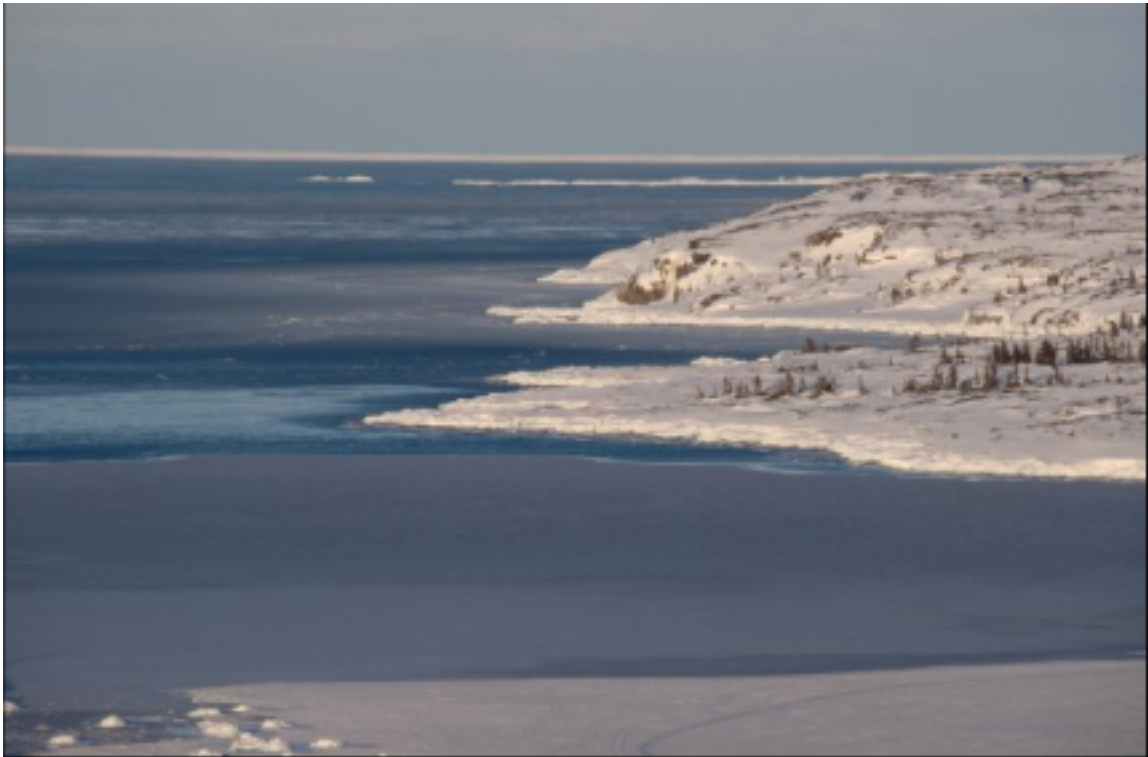
Makkovik Bay Maggoviup kangidlua

Maggovik ilangauvuk tallimanut nunaliujunut Nunatsiavut iluani. Nunattanga nakvâtaugunnaKuk Labradorip satjugiangata taggâni. Inuit inovikAsimalittilugit tamâni nunami ununnisanik tausintinit jârinit, Maggovik tungaviliuttausimavuk kisiani 1860mi (JW Consulting Associates, 2009).