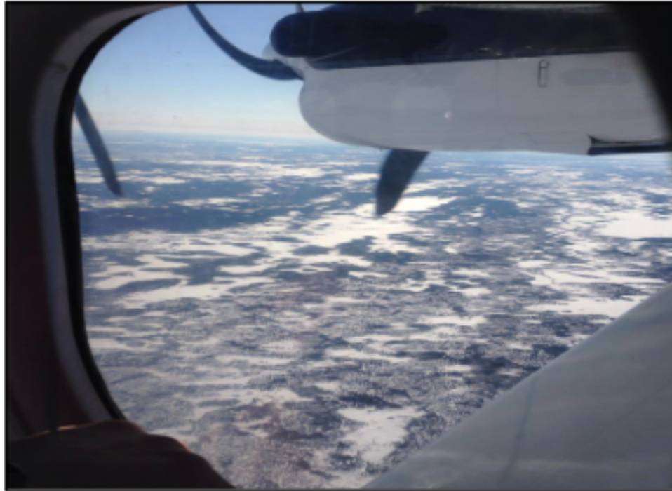
Flying over Nunatsiavut near Makkovik Tingijuk Kulâgut Nunatsiavut Kanitangani Maggoviup

(DOEC), Department of Health and Community Services, Municipal and Intergovernmental Affairs, amma Service NL. Tâna pannaigutaujuk kamagijaujtsaunialittilugu ilonnainut puttuniKatigengitunut kavamaujunut (Government of Newfoundland and Labrador DOEC, 2013; Government of Newfoundland and Labrador DOEC, 2014a; Government of Newfoundland and Labrador DOEC, 2014b).